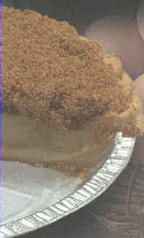
12071 BOSTON CREME