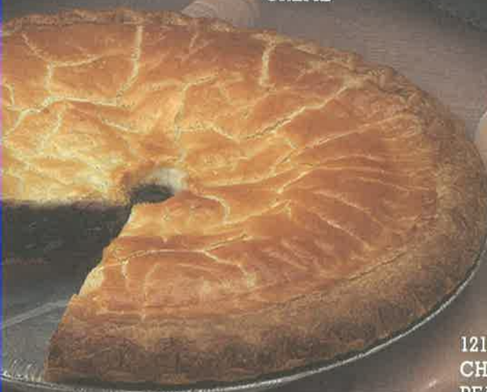
12151 CHOCOLATE PEANUT BUTTER