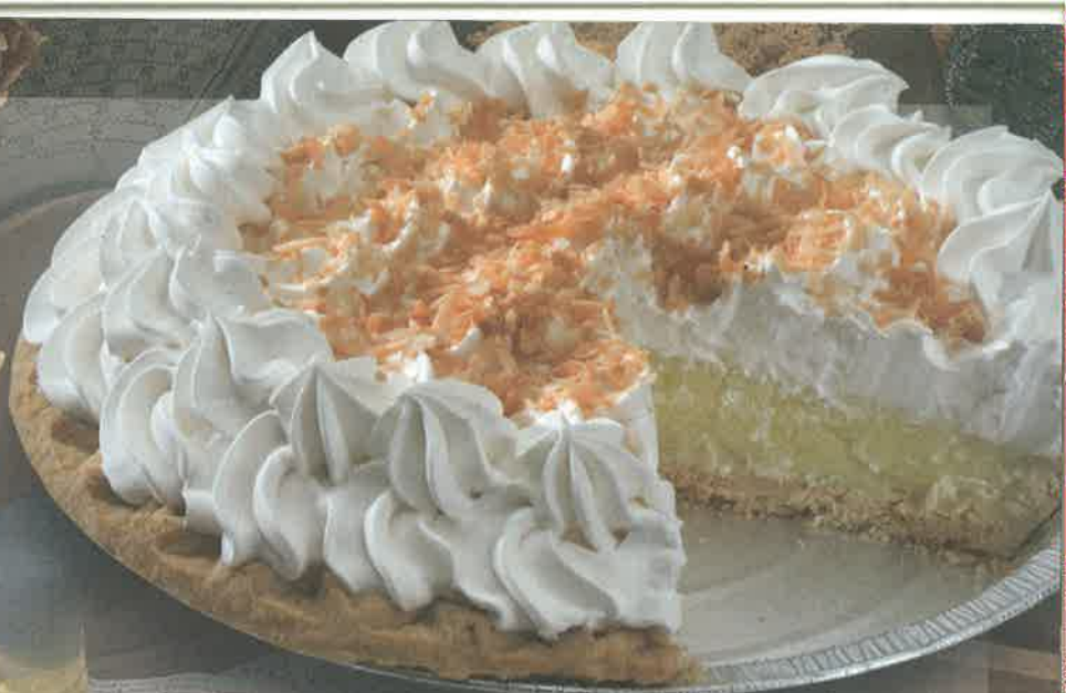
12161 COCONUT CREME